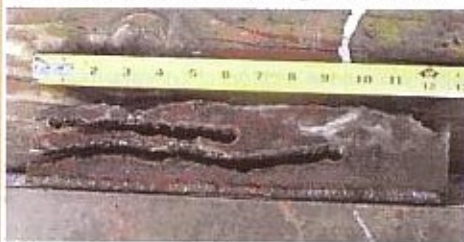
¾" plate. The end cut was 1½ rods. The other two cuts are one rod each.

arrestors; flow valves; insulator hoses.