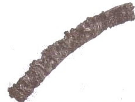
1 1/4" plate 9" in length cut with 6 1/2 rods.

Myself and Lead Tender Justin Armstrong who has recently completed Burner 3 class, used the rod on 1/4" plate, 1/2" plate, schedule 80 6" pipe, and 1" and 1 1/4" plate.