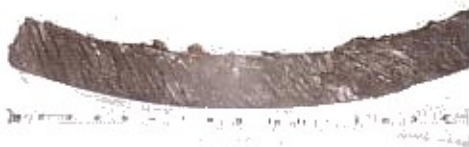
18" of 2 1/2" steel using 1 and 1/2 Tubular Steel Rods. No Hangers. 1 Minutes, 30 Seconds.

There are two parts to this article: My report on the rod for Cal Dive Int, and what that testing brought up in my mind. The picture below is just to drive home why I believe the Swordfish is not a replacement but an added tool.