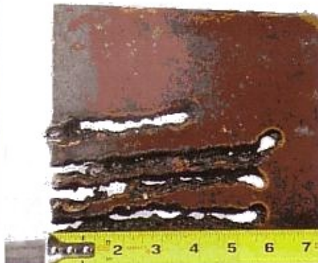
1/2" plate. Each cut is one rod. All cuts are complete. Some are slag-filled.