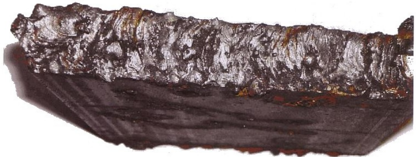
1" plate 5" cut with 3½ rods.

of depleted wells, and the removal of associated production platforms. With the amount of injury and death over the last 30 years involving commercial divers and Oxy-Arc underwater cutting, many of the major oil companies are reluctant to allow the use of this still viable tool.