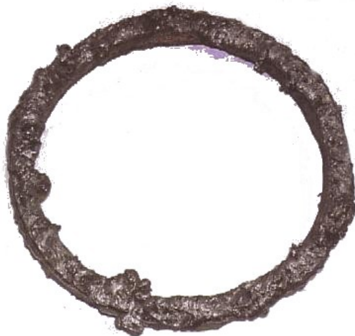
6" schedule 80 pipe, cut with 2 1/2 rods.

We were both able to cut all metals tested successfully. We also attempted to cut 2" plate and have had no success to date.