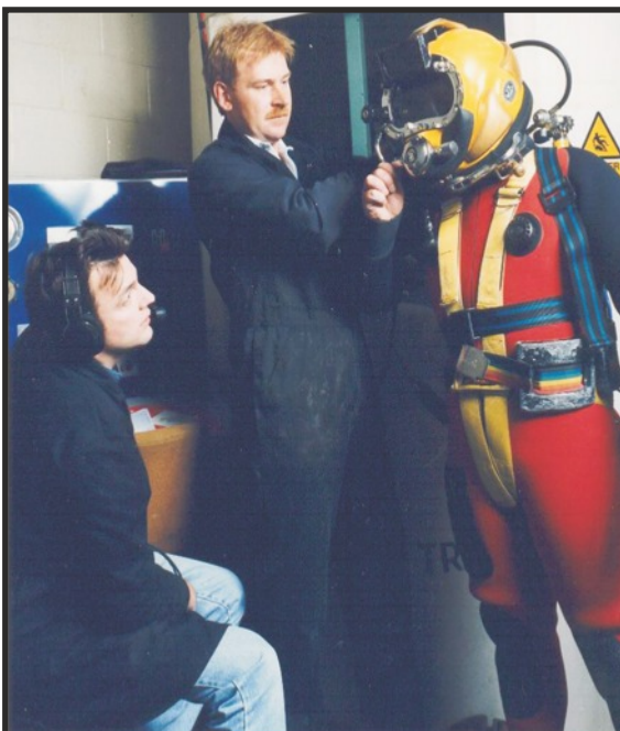
Diver undergoes pre-dive checks, prior to diving

Formal certification includes; BSEN 15618-1, AWS D3.6M and BS 4872-1.